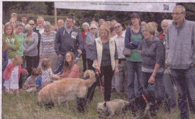
Campaigners at Chaucer Fields