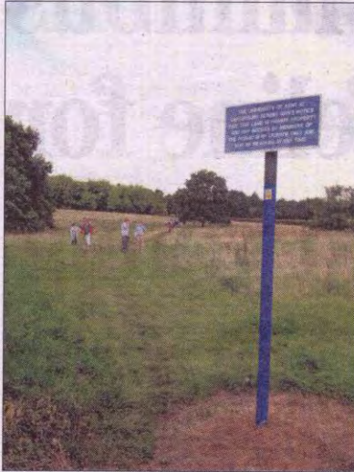
GREEN SPACE: Chaucer Fields, above, and right the proposed development