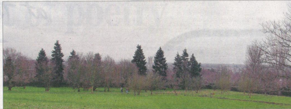
GREEN SPACE: Chaucer Fields, which protesters say is meant to be left undeveloped according to the terms of its sale

"His advice was unequivocal and the university were specifically told the campus site should