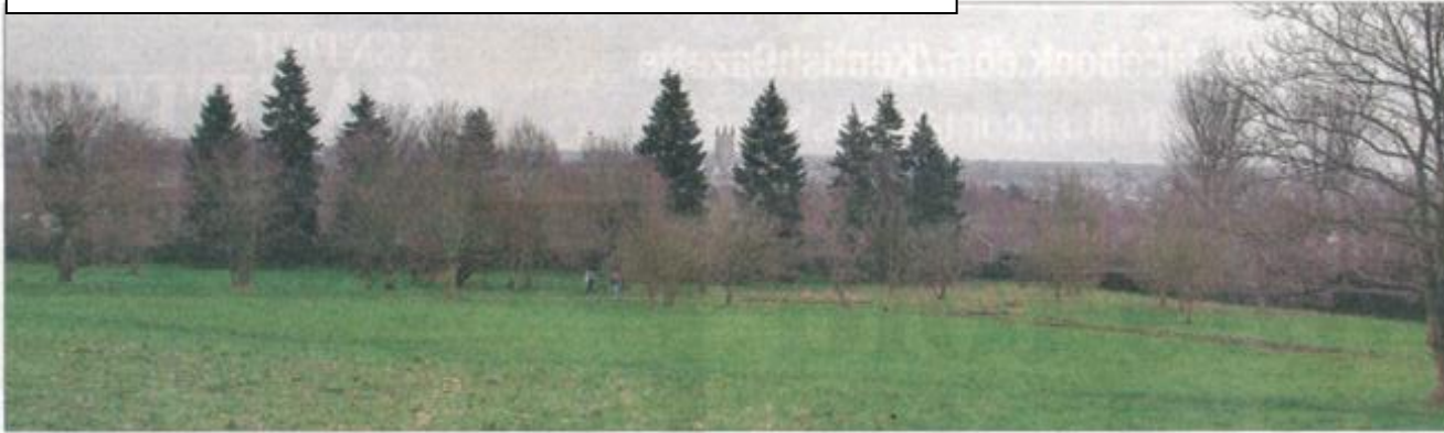
UNPOPULAR CHOICE: Chaucer Fields, the suggested site for a conference centre and student accommodation