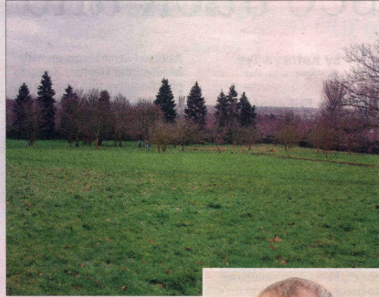
Chaucer Fields, overlooking Canterbury city centre, the planned site for a hotel, conference centre and accommodation for the University of Kent

■ What do you think? Email kentishgazette@thekmggroup.co.uk or write to Gazette House, Estuary View Business Park, Whitstable, CT5 3SE