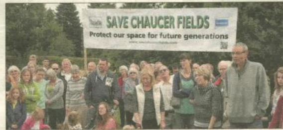
Campaigners battle to save Chaucer Fields from development

Local residents said they had proof the 43-acre plot had been used for recreation for 20 years – giving it village green rights – and lodged an application in a bid to save it from development.